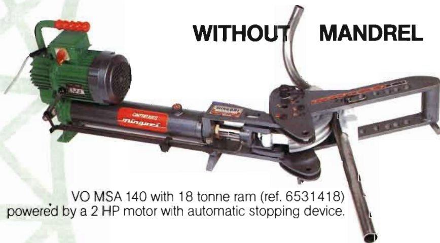
VO MSA 140 with 18 tonne ram (ref. 6531418) powered by a 2 HP motor with automatic stopping device.