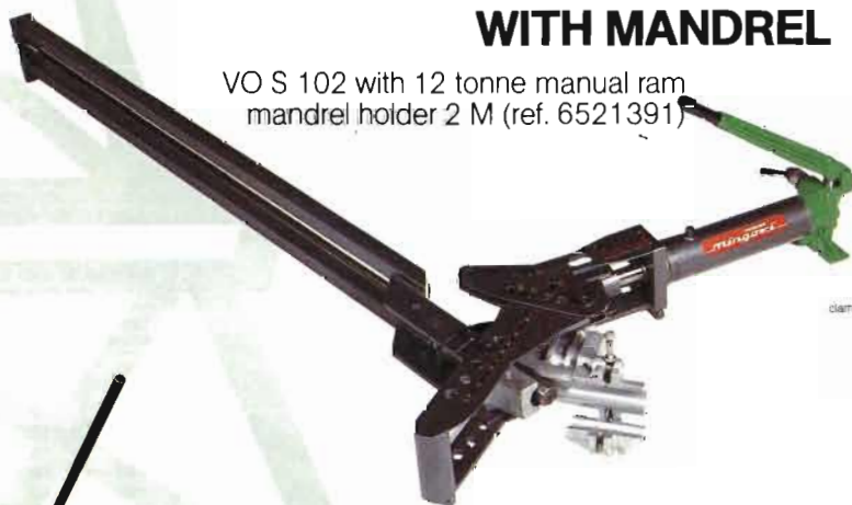
VO S 102 with 12 tonne manual ram mandrel holder 2 M (ref. 6521391)