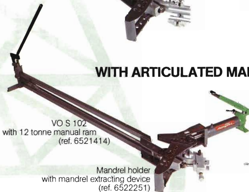
VO S 102 with 12 tonne manual ram (ref. 6521414)